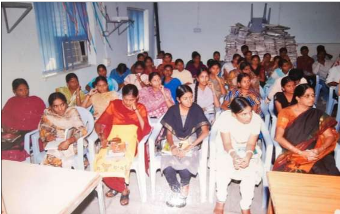
Student's participation in the seminar on 04-11-2016