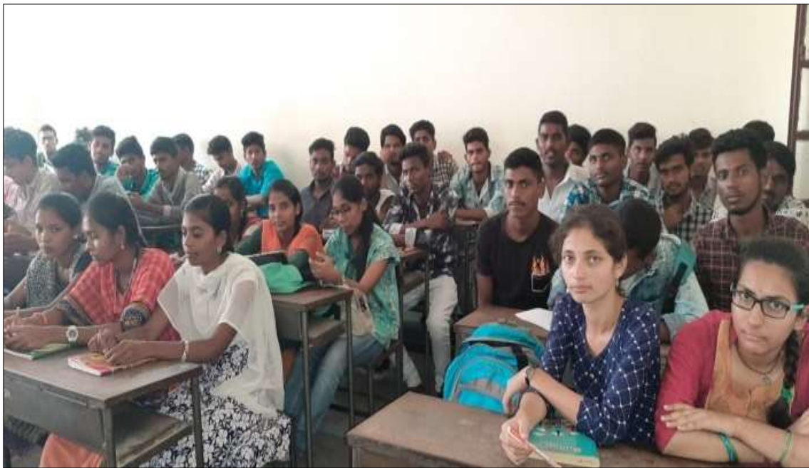
Student's Participation in the seminar